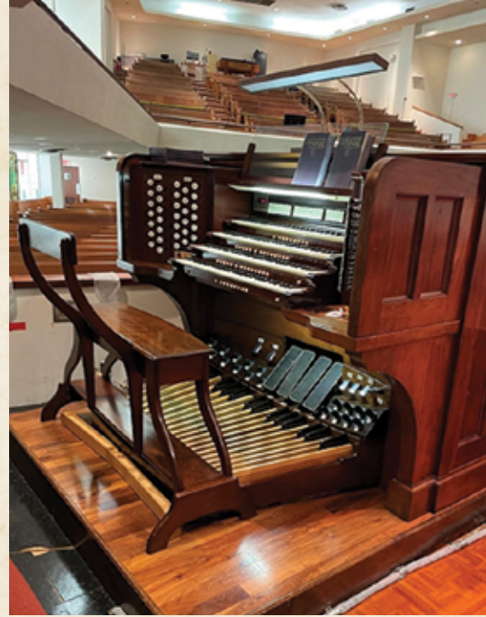
E.M. Skinner 532 console

If you are interested, please contact me.